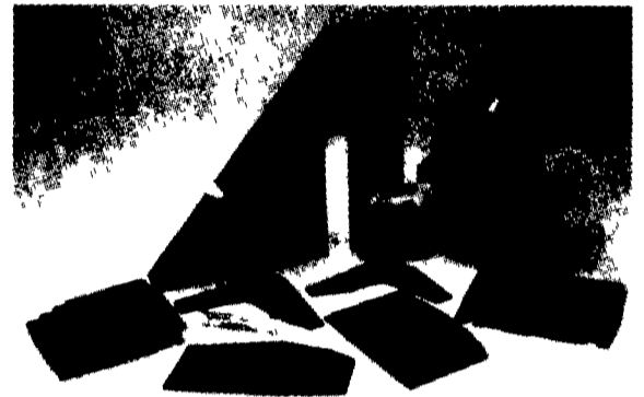
Poly Skid Shoe Kit

B93433 1020 20' kit $345.44 B93431 1020 25' kit $406.58