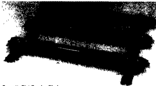
Smooth Slat Feeder Chain

For 80-88 series combines B93528 w/drum - $1363.38