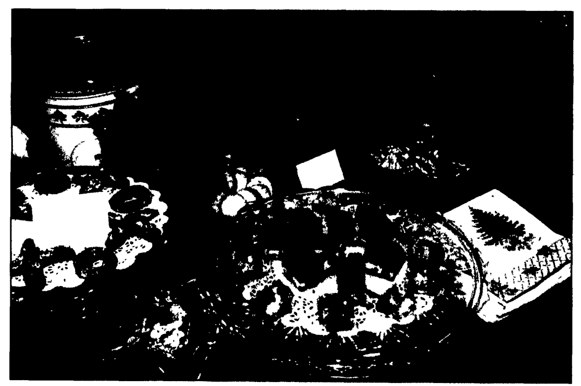
Get a head start on holiday entertaining by preparing make-ahead foods and freezing until ready to use.