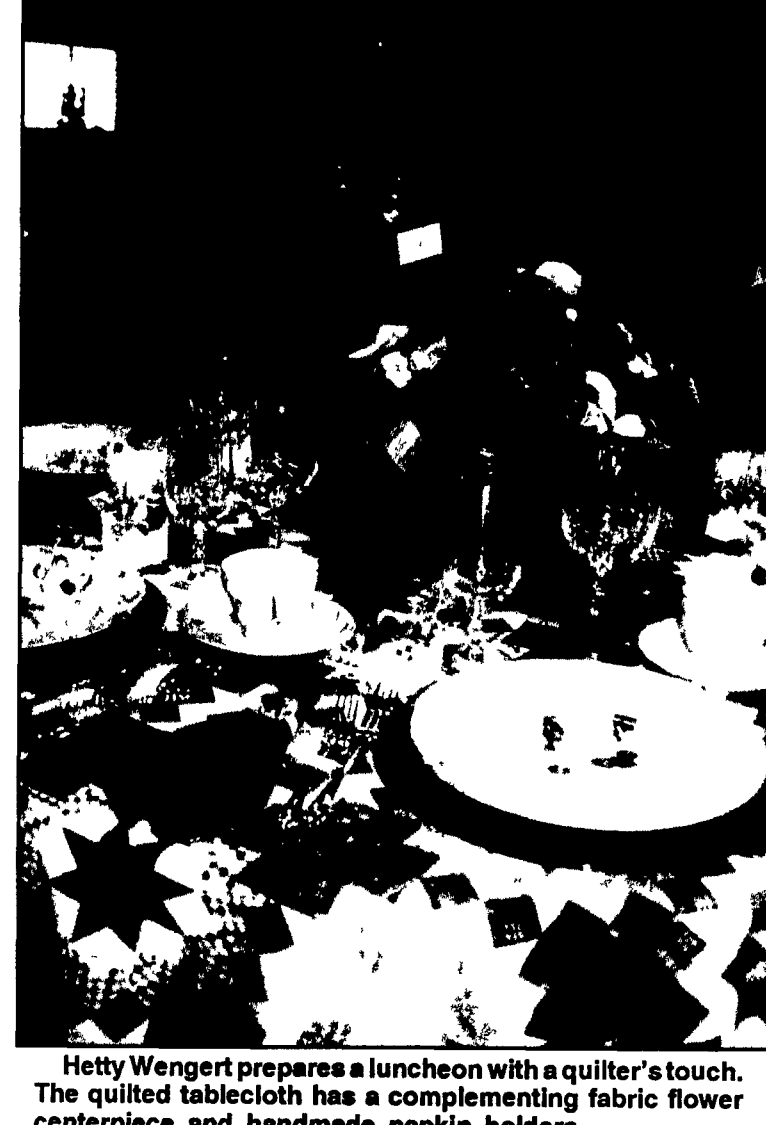
centerpiece and handmade napkin holders.

Regardless of what you decide, here are some ideas to incorporate into your plans.