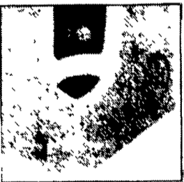
A rotocast polyethylene body features thick urethane insulation. Each 72" unit has 6 recessed heavy web anchors

Plenty of water is important! • Large 3" drains are located at each end. The complete fountain will fill in 78 seconds at 50 PSI. A single 72" model will water 125 head of dairy stock or 250 head of beef cattle. These capacities double with the 144" model. • Easy access to valve and float. • Thick urethane insulation. • Rotocast polyethylene body. • Available in 72" and 144" models. • Available in 72" and 144" models.