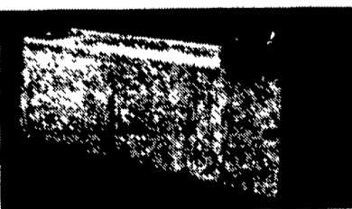
A single 72" model is just half of the 144" unit

Plenty of water is important! • Large 3" drains are located at each end. The complete fountain will fill in 78 seconds at 50 PSI. A single 72" model will water 125 head of dairy stock or 250 head of beef cattle. These capacities double with the 144" model. • Easy access to valve and float. • Thick urethane insulation. • Rotocast polyethylene body. • Available in 72" and 144" models. • Available in 72" and 144" models.