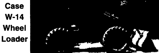
Case W-14 Wheel Loader

5859 Urbana Pike Frederick, Md. 21701 301-663-3185