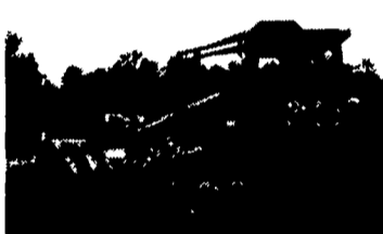
Case 1455 Crawler Loader, 1987, 4500 Hrs., Cab w/Air, New UC, New Paint.....$26,500

Look For Our Discount Roofing Ad in the Building & Supply Section