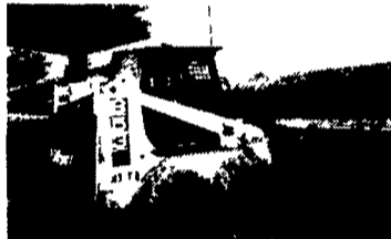
94 Bobcat 853, 1000 Hrs.....$14,500