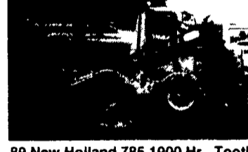
89 New Holland 785 1900 Hr., Tooth Bar & Pallet Fork.....$11,500 New Rubber.....$12,000