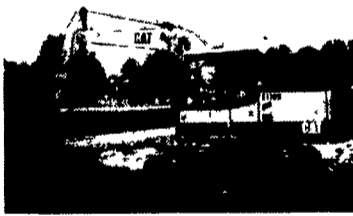
91 Cat 110B New Pins & Bushings & Sprockets, Long Stck....$27,500