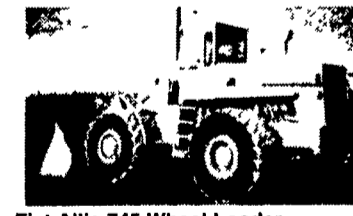
Fiat Allis 745 Wheel Loader, Good Rubber, New Paint, Good Condition.....$22,000