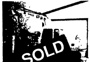
JD 490 Hyd. Excavator, 1989 w/2800 Hrs.....$27,000