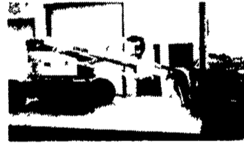
Simon 1991 AT60C w/Diesel, Low Hrs., 4x4.....$26,000