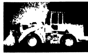
JD 544E 4-in-1 Bucket, New Paint, 17.5 Rubber 90%, Only 6400 Hrs.....$36,000