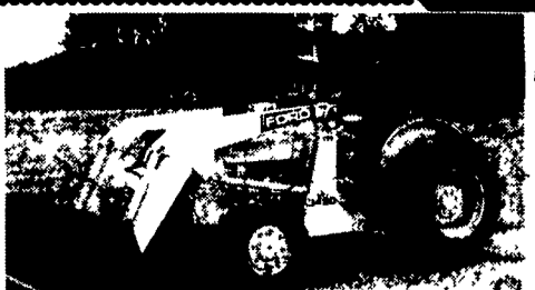
1989 Ford 345C 4x4 w/Loader, Torque Converter, 3 Pt. PTO, Nice $13,000