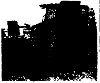
UT 4026 72" Bucket, New Tires, Aux. Hyd. Only $12,900 Serviced, Ready To Work