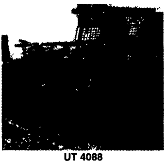
Loaded With Options