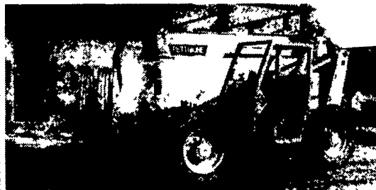
1986 Bobcat #743 skid loader w/stone & dirt buckets, pallet forks & mounting for backhoe approx 2200 hrs.