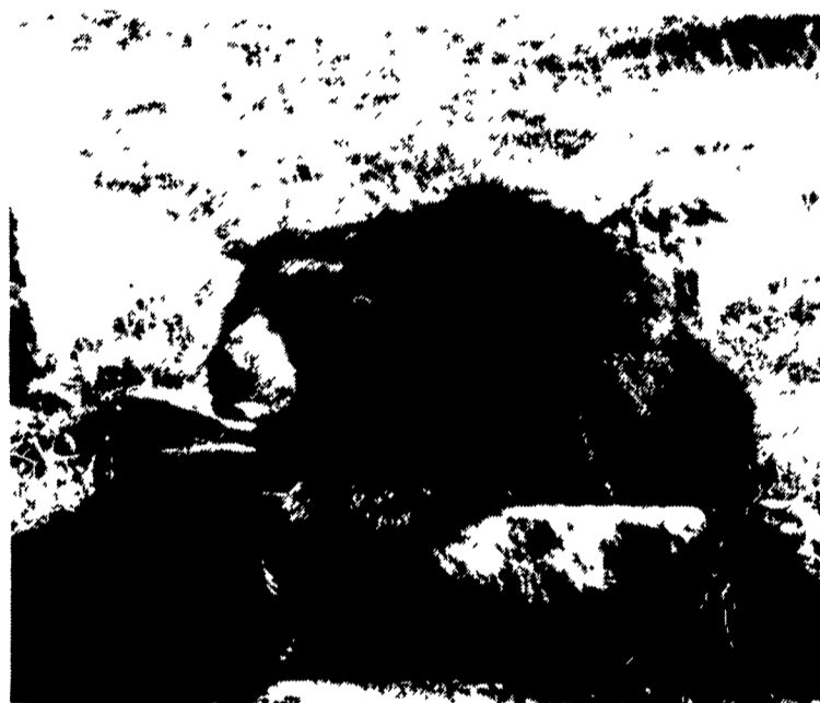
During the cooler months, most of the animals are more alert and active, much to the delight of visitors.