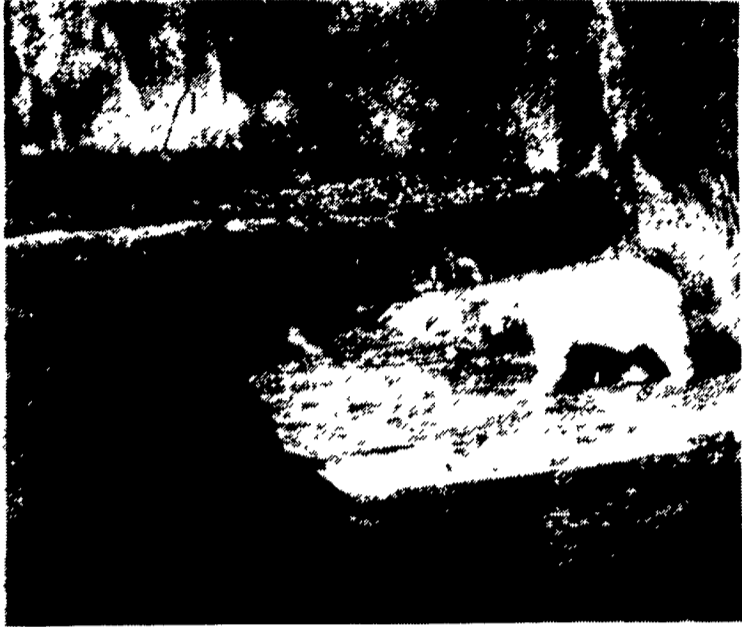
Polar bear is considering taking a cool splash.

For more information about the zoo, call (215) 243-5200 or after business hours, call (215) 243-1100.