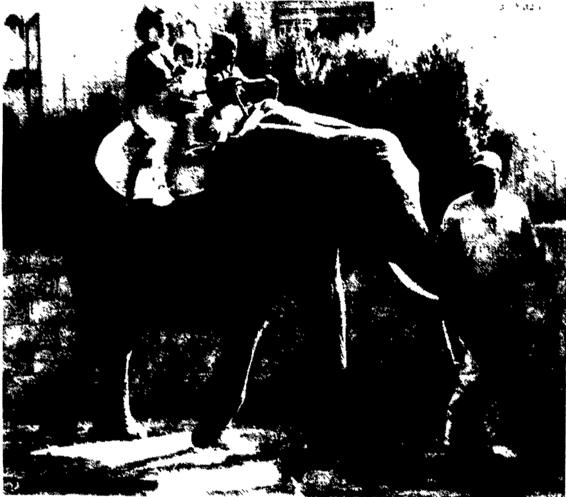
For a real thrill, take an elephant ride. In addition to the entrance fee, it costs $4 to ride the elephant and $3 to ride a camel.