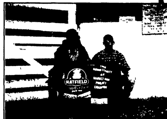
Champion Project Market Swine Hatfield Quality Meats

Reserve Champion Project Market Steer Reserve Champion Project Market Steer Reserve Champion Project Market Sheep Reserve Champion Project Market Swine