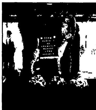
Champion Project Market Sheep Great Valley Bank/Lebanon Valley Farmers Bank