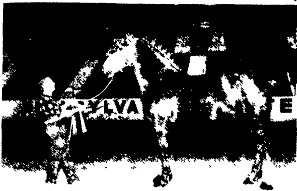
Percheron show grand champion gelding, Cynthia Formosa Allingham, West Sunbur.