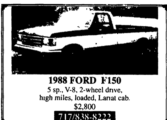
1988 FORD F150 5 sp., V-8, 2-wheel drive, high miles, loaded, Lanat cab. $2,800 717/838-8222