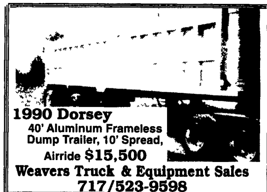
1990 Dorsey 40' Aluminum Frameless Dump Trailer, 10' Spread, Airride $15,500 Weavers Truck & Equipment Sales 717/523-9598