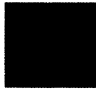
After With the hole repaired by ShotCrete and a new surface applied, the silo is ready for years of use