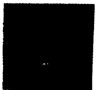
After The ShotCrete System repairs and replaces the missing structure

One 20' Patz Ringdrive Unloader w/Power Winch One 20'x60' Lancaster Used Silo One 14'x65' Ribstone Silo All Sizes of S&S Silos Available