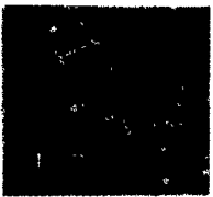
Before A hole is worn completely through the silo wall