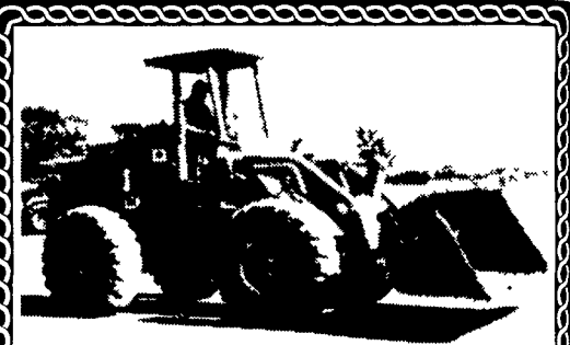
Hough 65 Articulated Wheel Loader $8,500

P.O. Box 407 • Route 29 • Palm, PA 18070 Phone: (215) 679-3900 • Fax: (215) 679-8727 TOLL FREE: 1-800-322-8030