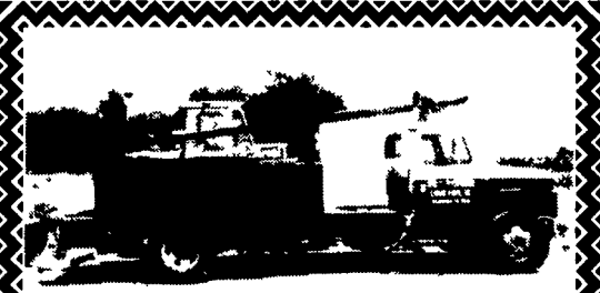
1984 International S1600 Service Truck, 21,000 GVWR, 5-Spd. Trans., 6.9L Dsl., 15' Service Body w/Draft Horse-6,000 Lb. Crane.....$7,500

Heavy Equipment Loader Parts, Inc. 10070 Allentown Blvd., Grantville, PA 17028 (717) 469-0039 (800) 446-0505