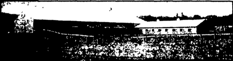
RIDING ARENA AND HORSE STALL BARN

Check with Agri-Inc. where quality is our standard.