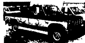
86 FORD F250 4X4 V8, 4 Speed, PS, PB