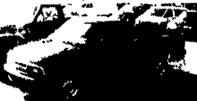
95 CHEV S-10 LS, 4x4 4 3 V6, 5-Speed, 50,000 Miles, Red