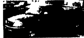
97 FORD F150 EXT. CAB XLT, 4 2. AT, Most Options, 3-Door, 8,000 Miles