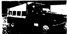
94 CHEV KODIAK DUMP 10 ft Dump Body, 3116 CAT, 6-spd, A/C 25,700 GVW, 41,000 Miles