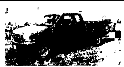
1999 Ford F250 Super Cab 4x4 XLT, V8, AT, Ready to go.