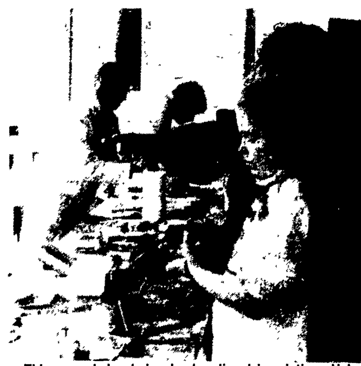
This young lady admires her handiwork in painting a Hal-Joween pumpkin, as part of an art activity about agricultural products and traditional festivities. In the background, a couple of PDA employees dressed in white lab coats help the youth with their painting.

Three rows of tables were set up in the lot where PDA employees distributed the 3,000 packets of agricultural information they put together to give to the students.