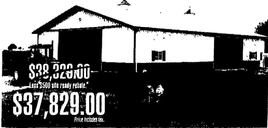
54' x 14' x 90' Deluxe Machine Storage Facility Raised Chord Truss System 7'8" On-Center

$21,900.00 Less $500 site ready rebate. $20,408.00 Price includes tax.