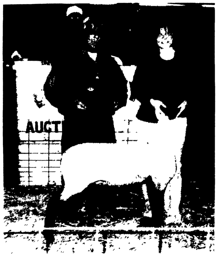
Lavere Hook representing buyer Middleburg Livestock Auction stands with Alaine Bower who holds steady her grand champion market lamb of the Bloomsburg Fair.