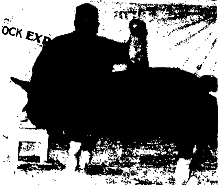
The grand champion Berkshire barrow is shown by Greg Innerst, Red Lion.