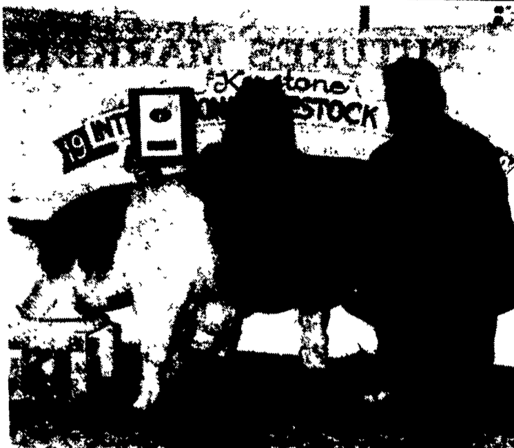
Sarah Boyd's crossbred barrow is champion of the junior show and over-all grand champion junior barrows on-foot and reserve champion over-all on the rail. Boyd is shown with Merrill Smith, judge.

See more KILE barrow show results on page A37.