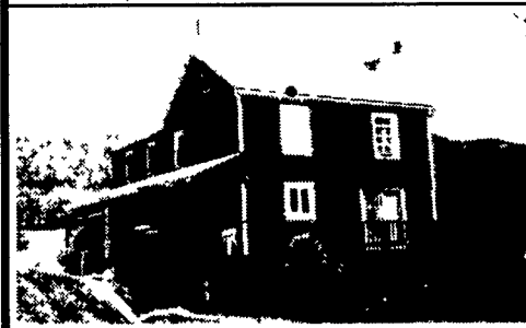
35+ ACRES OF PASTURE, WOODED, AND FARM