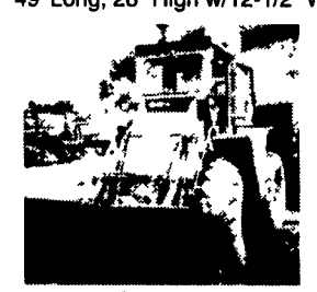
W7 Case Loader., 15 5x25 tires, runs good serial #9900486