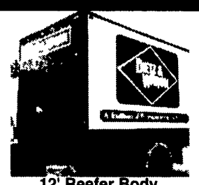
12' Reefer Body.