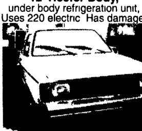
1981 Volkswagon Rabbit Diesel, 4 Spd , 177,354 Mi , 2 Door, Needs Driver-Side Fender