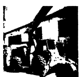
Clark Crane 14 Ton Capacity, 4-53 Detroit, 60' boom, 14.00x24 tires, runs good serial #720