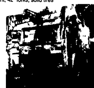
1988 Volvo/White 3306 Cat engine, 740 Allison, Rockwell rears, 11x22.5 tires, G trash body model FLSC35 Galion