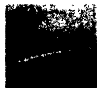
Before The bottom part of the stave's are completely worn away