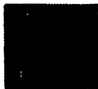
Before A hole is worn completely through the silo wall