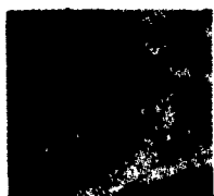
After The surface is reconditioned, and a new, thick tough surface will protect stored feed.