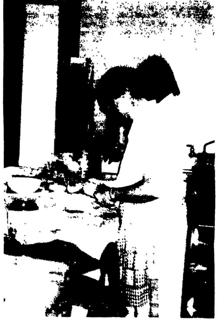
Homemade apple dumplings will be sold during the Conestoga Christian School's annual auction to be held Oct. 16-17.