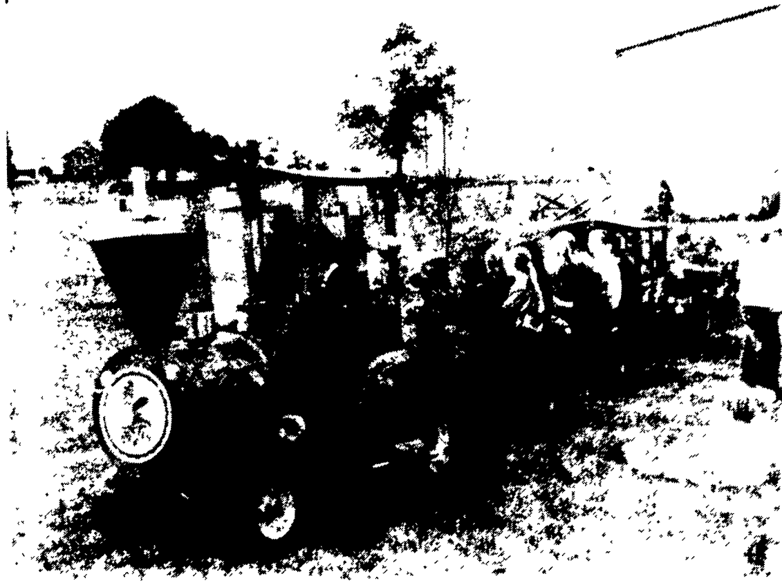
One of the activities available for children during the school's benefit auction is a train ride. The children's activity area offers inexpensive toys to buy and activities and crafts for children to do.

cal businesses, friends of the school and school patrons, provide another opportunity for buy- (Turn to Page B18)