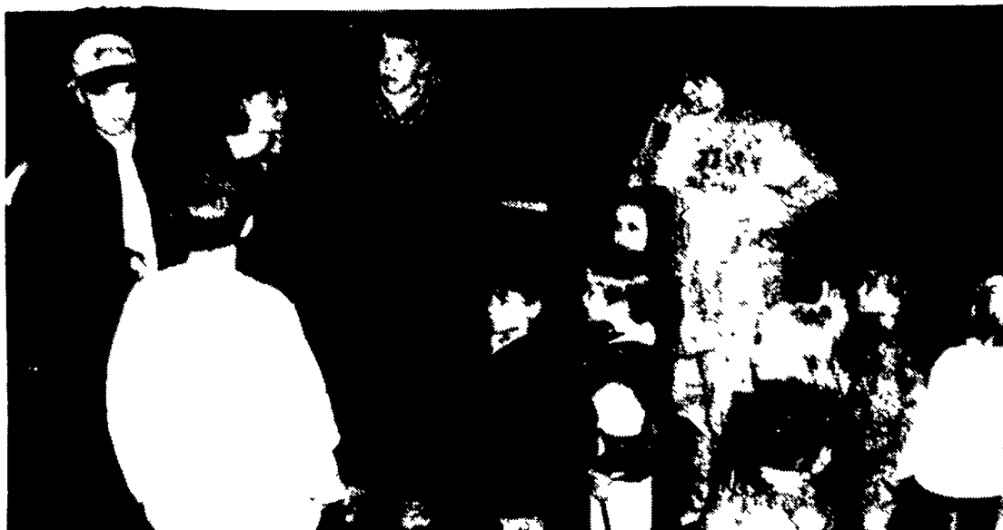
On the left, a group of four volunteer older youth provide a tour of displays and events of the Keystone International Livestock Exposition to a leader and youth from the Oakwood Baptist Day School. The volunteer youth are members of 4-H and have exhibited animals at KILE.