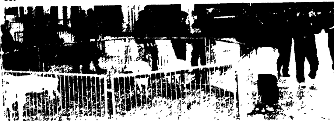
Contestants in the Keystone International Livestock Exposition Keystone Stockmen's Contest finish judging a pen of sheep in the state Farm Show Complex before moving on to the next testing station. KILE offers youth a variety of educational and fun activities.