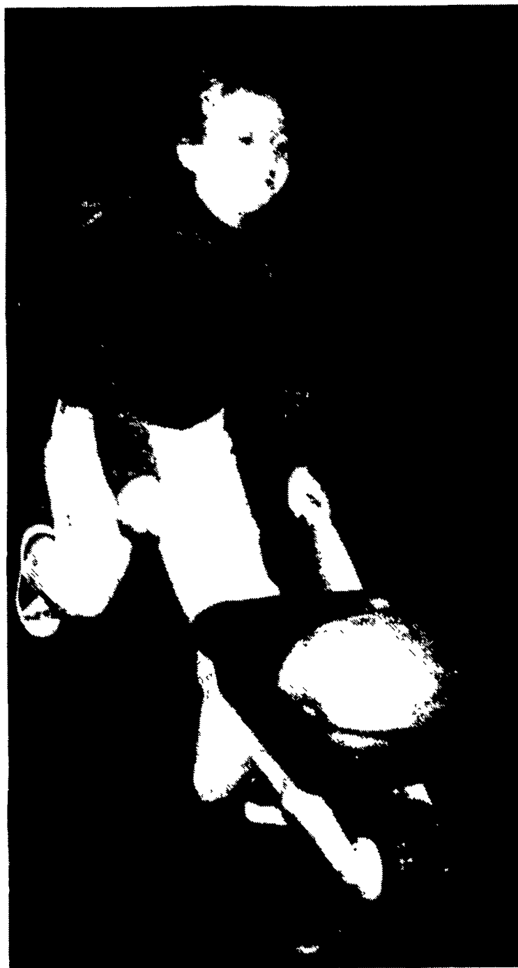
Kids had a blast participating in the Agri-Kid Olympics sponsored by Lebanon Valley Farmers/Fulton Bank on Saturday at KILE.

To enjoy the last fling of fair fun, kids of all ages attended the Manheim Community Farm Show and Keystone International Livestock Exposition (KILE) held this past week.