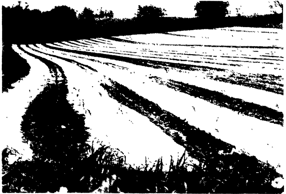
AKRON (Lancaster Co.) — More sweet corn growers than ever before are using plastic mulch to speed up the growth of sweet corn for early production. In May 1998, a Corn Talk photographer spotted this field on Akron Road near here, with corn plants making a head start on the season.

Contact your local extension office for details