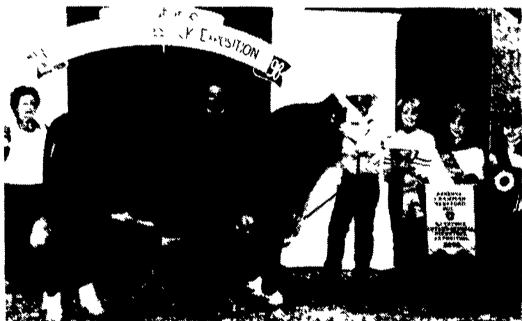
Reserve champion Hereford bull at KILE went to Iron Forge Farm, Lebanon.