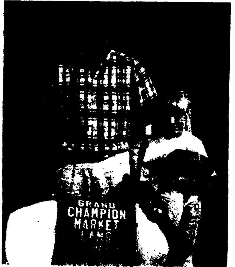
Katelynn Curtis and her grand champion market lamb.