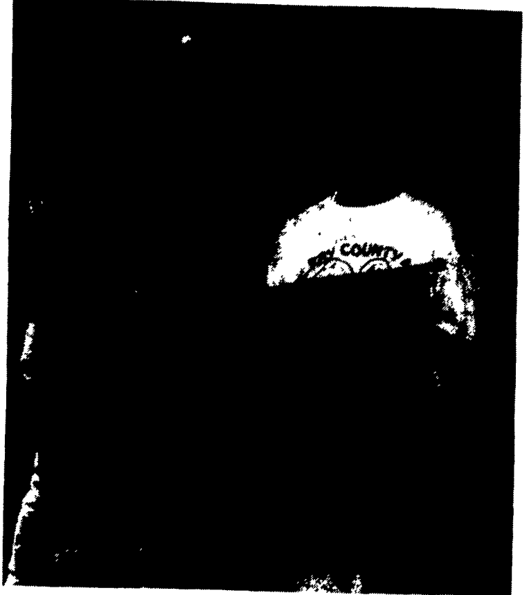
Supreme showman Sheena Hines and reserve supreme showman Bart Gill.