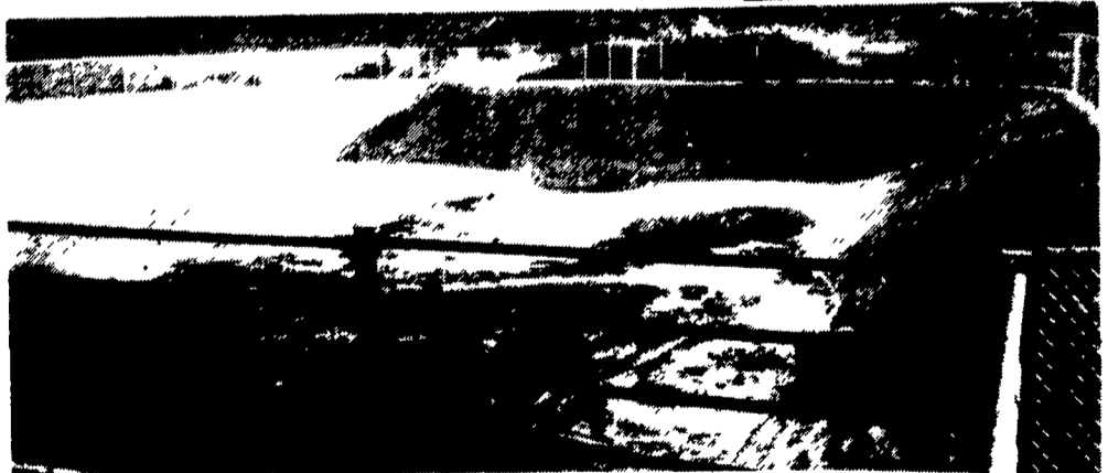
SCS Approved Manure Storage Facility

Specializing In Manure Storage Round or Rectangular, In-Ground or Above-Ground