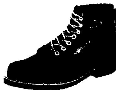
6 inch style 344