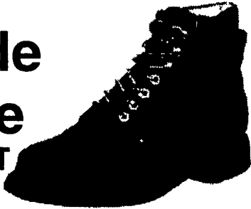
6 inch style 346