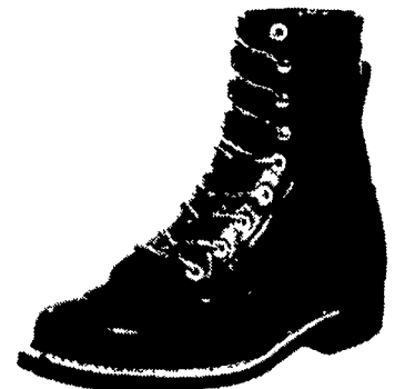
8 inch style 844