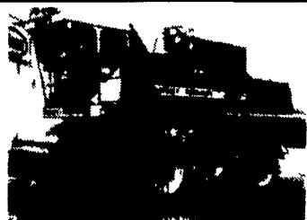
1990 MF 8460 Combine with Hillside Cleaning, 20 Ft Floating and 6 Row Corn Head, 2189 Hrs. $67,000

1993 Case IH 1688 4x4 Combine with 8 row corn 15' flex head 20' flex head... COMING IN