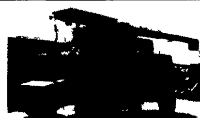
1984 MF 860 4x4 Combine Ser # 18839 2,478 Hr $18,000

1993 Case IH 1688 4x4 Combine with 8 row corn 15' flex head 20' flex head... COMING IN