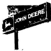
JOHN DEERE 9510 MAXIMIZER™ COMBINE

Watson town Deerfield Ag & Turf Center, Inc. West Chester M.S. Yearsley & Sons, Inc. WEST VIRGINIA Moorefield K&W Equipment, Inc.