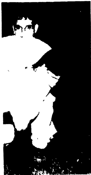
The reserve champion lamb was shown by Ryan Donough.