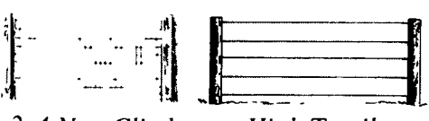
2x4 Non Climb