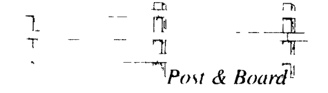
Post & Board