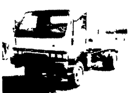
1998 MITSUBISHI FG 4X4 14' Cab and Chassis, Diesel, 5 Speed, 12,000 GVW Call For Details