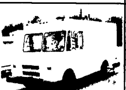
1984 Chev P-30 12 Ft Alum Step Van Diesel, Auto, 12,000 GVW, 80,000 Miles, Clean $4,900