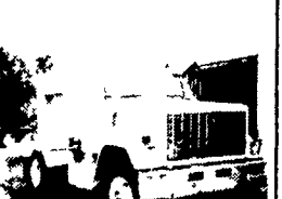
1980 GMC S/A Tractor 3208 Cat, 250 HP 9 Spd, Air Ride, Very Clean $4,800