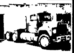
1975 Mack T/A (1983 300 HP Motor) 5 Spd Double Frame Heavy Truck, 56,000 GVW $4,900