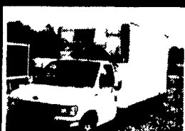
1995 Ford E350 14 ft Reefer Van-CB10 - Thermo King Unit, A/C Auto, 11,000 GVW, Like New Condition