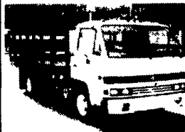
1993 GMC W-4 14' Flatbed w/Sides, Diesel, Automatic, 11,050 GVW, Clean $11,900

ROUTE 24 - CAPE HORN RD RED LION, PA 17356 (717) 244-4903 Now Providers of New Western Star Trucks, Slots Available