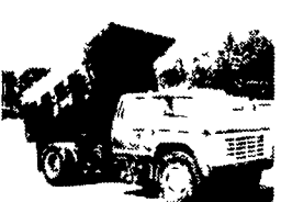
1979 F-800 Ford V8 5+2 Spd, 33,000 GVW, 9 Ft Dump, 90,000 Mi., Ex Cond $4,900