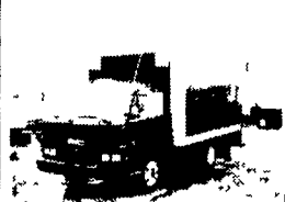
1994 GMC W4 Diesel, 5 Spd, A/C, 14,250 GVW, w/12 Ft Van, Ex. Cond Off Lease $11,900