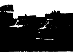
1990 Ford Super Duty 7.3L Diesel, 5 Speed, A/C, 12' Flatbed, 14,500 GVW $7,900