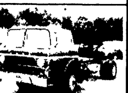
1981 CO8000 Ford 3208 Cat, 5+2 Spd, 38,000 GVW A/B 136" C to A $4,800