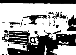
1989 IH DT466, 6 Spd, 33,000 GVW, A/B, 136" C to A - 135,000 Miles, Ex Cond