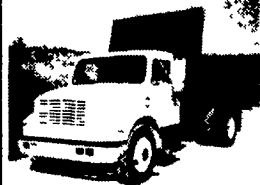
1992 IHC 4700 14' Flatbed Dump, DT 360, 5 Speed, PS, 130K, 25,500 GVW, No CDL $18,900