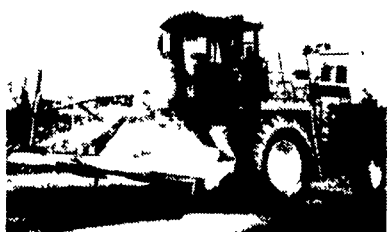
Just Traded - 96 JD 6710 Harvester 4x4 Corn Cracker Hay Head, 4 Row Kemper, 509 Hrs $148,000