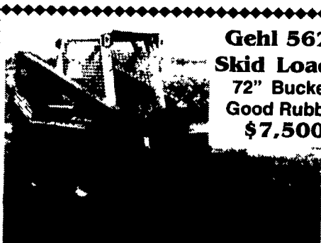
Gehl 5620 Skid Loader 72" Bucket, Good Rubber $7,500