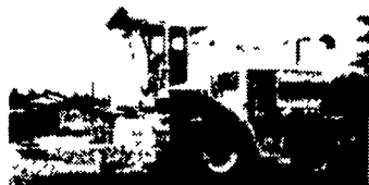
N.H. 2115 Forage Harvester, 4WD, 960 Hours, N.H. 360 N4 4-Row Corn Head, N.H. 340W Windrow Pickup, Real Sharp