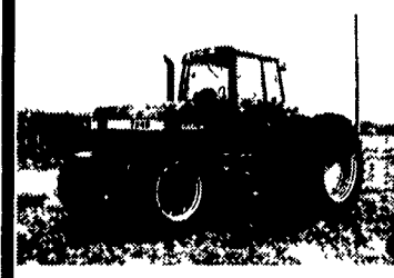
Case IH 7240 4WD, 200 Hrs $79,500