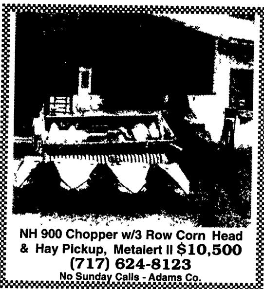
NH 900 Chopper w/3 Row Corn Head & Hay Pickup, Metalert II $10,500 (717) 624-8123 No Sunday Calls - Adams Co.

SALES - PARTS - SERVICE GUS FARM EQUIPMENT, INC. State Route 616 Seven Valleys, PA 17360 717-428-1967 gusfarm@aol.com