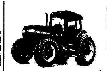
Case IH 7220 4WD, 2,000 Hrs. $55,000