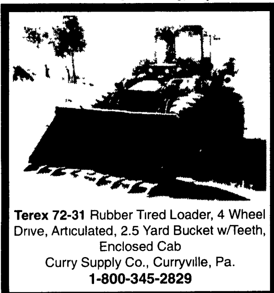
Terex 72-31 Rubber Tired Loader, 4 Wheel Drive, Articulated, 2.5 Yard Bucket w/Teeth, Enclosed Cab Curry Supply Co., Curryville, Pa. 1-800-345-2829