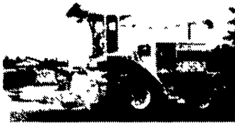
N.H. 2115 Forage Harvester , 4WD, 960 Hours, N H 360 N4 4-Row Corn Head, N H 340W Windrow Pickup, Real Sharp

50 North Greenmont Road, Rising Sun, MD 21911 410-658-5568 800-442-5043