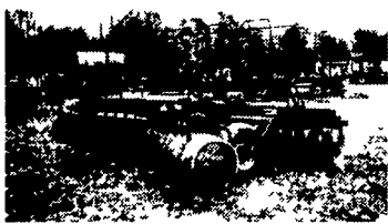
Case 475 Rock Flex Disc, 12' 22" Discs, 9" Spacing

NH 1495 Haybine, Diesel/Hydro NH 890A, N3, WPU, Harvester Heads NH 717 Harvester w/PU head Badger, BN950 Forage Box (2) NH 489 Haybine NH 2550 S.P Haybine 12' Head IH 86 Rolabar Rake NH 2000 Big Square Baler NH 2115 Self Propelled harvester