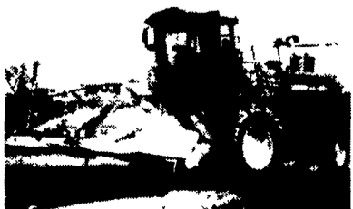
Just Traded - 96 JD 6710 Harvester 4x4 Corn Cracker Hay Head, 4 Row Kemper, 509 Hrs $148,000

Discover CLAAS THE HARVESTING SPECIALIST