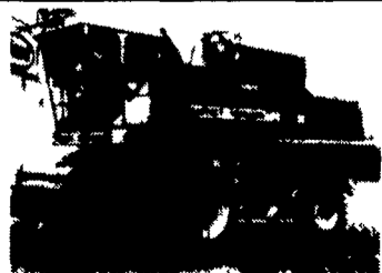
1990 MF 8460 Combine with Hillside Cleaning, 20 Ft Floating and 6 Row Corn Head, 2189 Hrs $67,000

COMING IN Claas 840 4x4 SOLD Harvester 1996