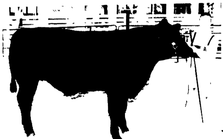
Overall grand champion steer was shown by Gwen Doebler.