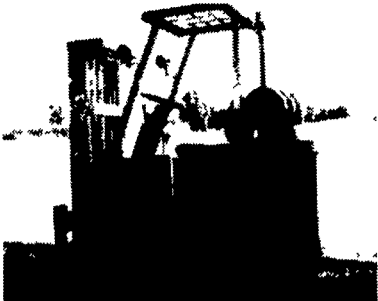
AC 3000 lb. Forklift LP, PS, Auto, Triple freelif mast. $2,900