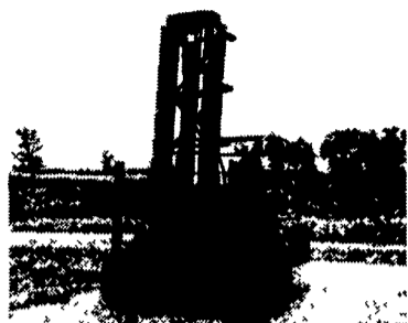
15,000 lb. Gerlinger Forklift, Ford V-8 gas engine, 4 speed, PS, Pneumatic tires, 48" forks, Mast 156/192. Works good $2,350

We buy sell and repair used equipment. Most Trade Accepted.