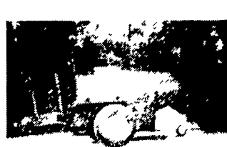
NH 2000 Baler, 3'x4'x8' Bale Real Sharp

GOOD SELECTION NEW KUBOTA TRACTORS IN STOCK!