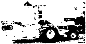
N.H. 2115 Forage Harvester, 4WD 960 Hours N H 360 N4 4-Row Corn Head, NH 340W Windrow Pickup Real Sharp

50 North Greenmont Road, Rising Sun, MD 21911 410-658-5568 800-442-5043