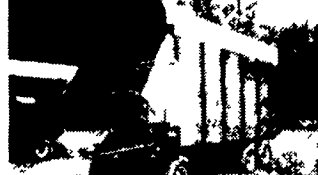
Badger BN950 Forage Box w/Tandem Gear, 2 Speed