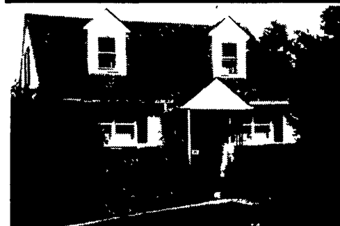
Real Estate: 1 pm

346 Martin Corner Rd., Coatesville, PA West Cain Twp., Chester County.