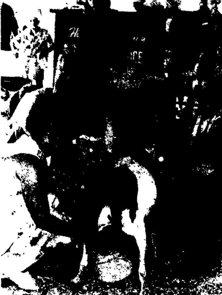
During the celebrity goat milking contest, Fair Queen Kim Wolgemuth tries milking a goat without too much success.