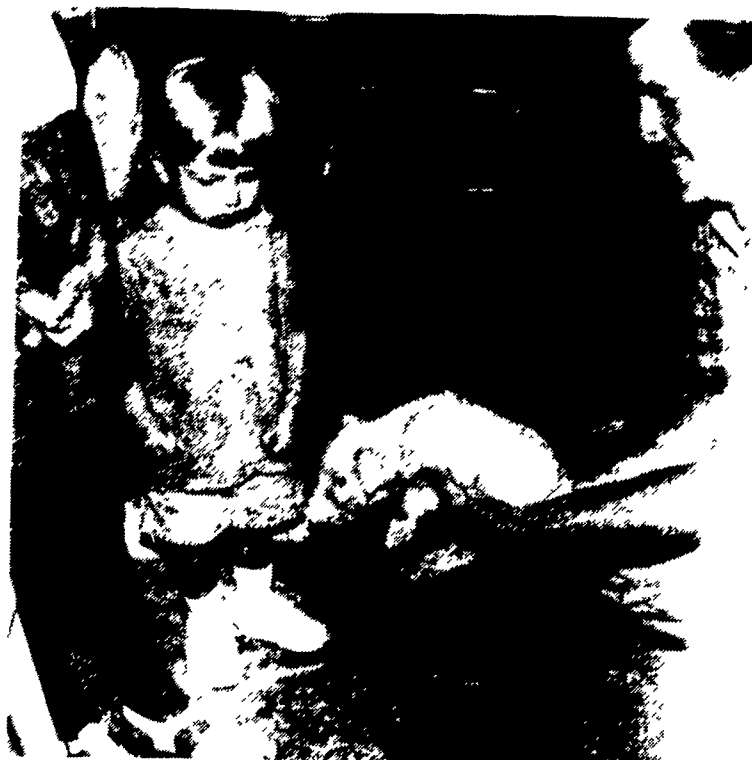
A litter of bottle-fed piglets fascinates fairgoers of all ages.