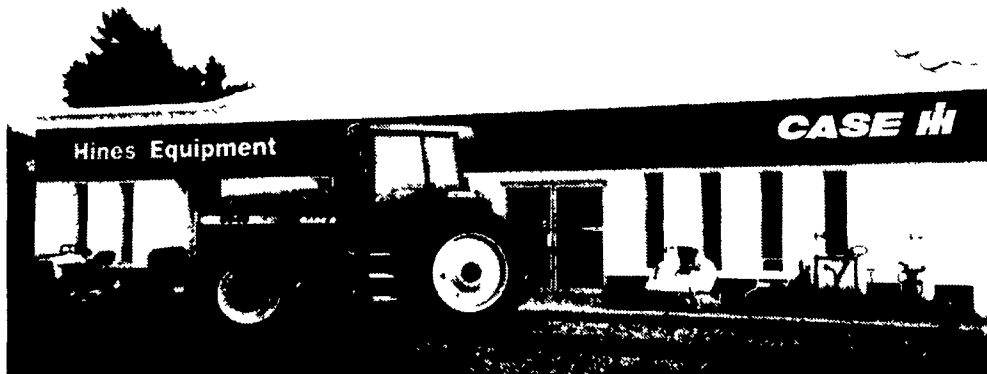
Hines Equipment - Cresson, PA

P.O. Box 5, Rt. 22, Cresson, PA 16630 1-800-245-6227 or 814-886-4183 FAX 814-886-8872 Old Route 220, Bellwood, PA 16617 814-742-8171