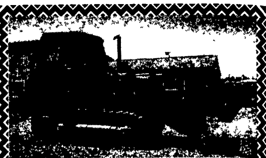
John Deere 755, Crawler Loader, EROPS, 4-1 Bucket $19,000

Fiat Allis 545B w/cab, heat, very good condition, $18,700. 717-534-1253 Finn hydro seeder 900G mounted on a '77 GMC truck, very good condition, $17,000. (610)987-3742.