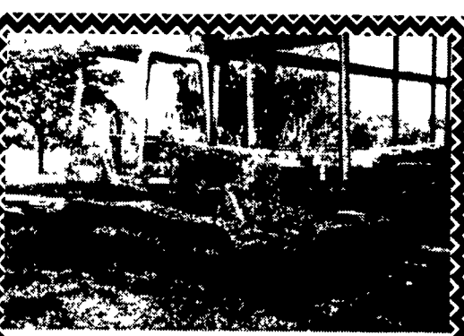
1984 Caterpillar D3B, Crawler Dozer, 6-Way Blade.....$20,000

Heavy Equipment Loader Parts, Inc. 10070 Allentown Blvd., Grantville, PA 17028 (717) 469-0039 (800) 446-0505