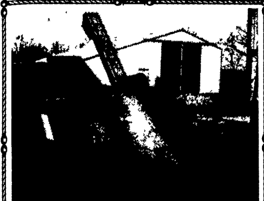
NI 325N Picker, 12 Roll Bed, Hydraulic Tongue, Very Later Model, Very Sharp, Excellent Condition, Like New

WHEEL LOADER Dresser 520B, cab, air, heat, 3,500 hrs., nice, $32,500. 410-833-9091