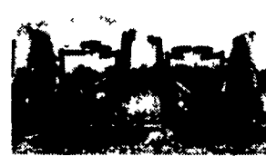
Bush Hog 2615 Flex Wing Mowers Prices starting at $7,995