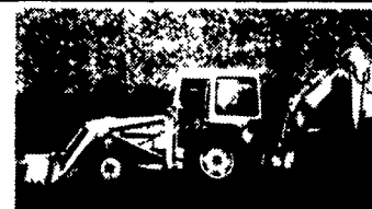
Ford 3500 TLB w/Cab, Good Condition $5,495