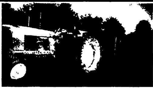
JD 2510 D

Several Gleaner F combi- nes starting at $2600. Zeisloft 800/919-3322.