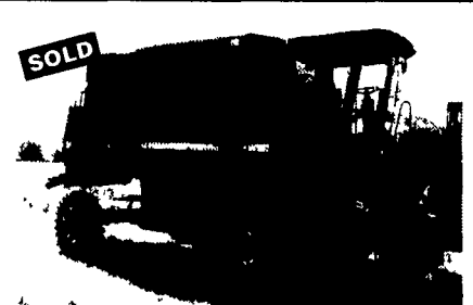
JD 9400, 1989, 3400 Hrs, 2WD, 2400 Separator Hrs., 30 5LX, 32RI Drive Tires, Straw Chopper, Good Condition... $46,000 Q