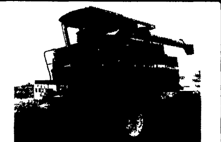
JD 6620 Titan II Sidehill 2WD, Straw Chopper, 28Lx26RI Tires 90%, Auto, Header Height, 3200 Hrs., Good Cond... $42,000 W